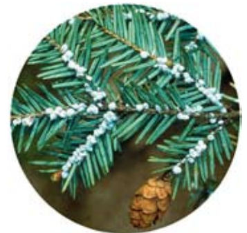
White cottony masses indicate a hemlock woolly adelgid infestation.