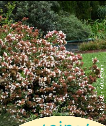
JC Paulston Arboretum