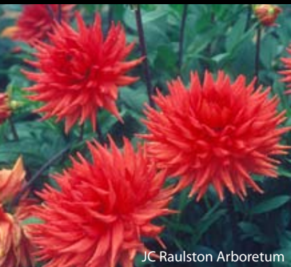
JC Raulston Arboretum