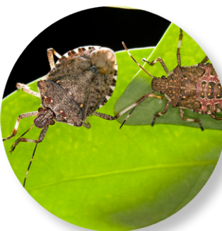
Brown marmorated stink bug Halyomorpha halys