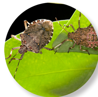
Brown marmorated stink bug Halyomorpha halys