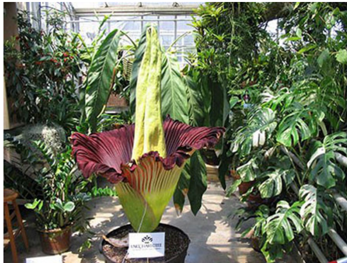
This Corpse Flower ( Titum arum ) bloomed in 2007 and reached 60 inches tall.

Outdoor areas of the botanical gardens are open every weekday during daylight, while the greenhouses allow visitors from 10:00 a.m. till 3:00 p.m. Monday through Saturday and from 1:00 to 4:00 p.m. on Sundays. Workshops, guided tours, and university courses are available