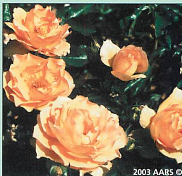
2003 AARS ©