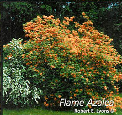
Flame Azalea