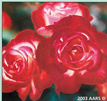
2003 AARS ©

'Eureka', which is nearly as wide as it is tall, provides a sparkling hedge-type look with its glittering gold hues. The 3 1/2-foot-tall AARS floribunda offers a beautiful, old-fashioned-looking bloom in rich apricot yellow with 4-inch flowers. In groups of three or five, 'Eureka' offers a golden anchor to the border, a centerpiece or accent area. This rose is expected to become very popular due to its abundant blooms, exceptional reblooming ability, glossy green leaves, easy-to-grow vigor and light fragrance.