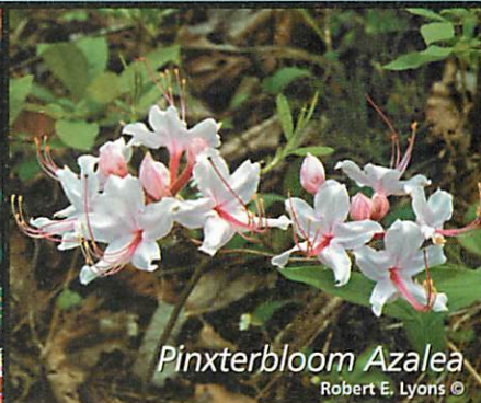
Pinxterbloom Azalea