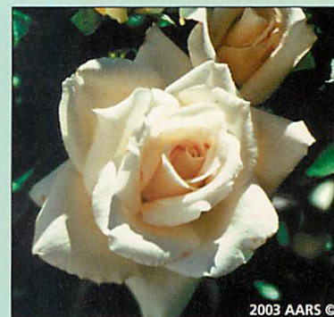
2003 AARS ©