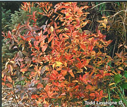
Todd Lasseigne ©