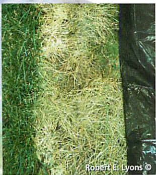
Robert E. Lyons ©

Natural ways to control pests are very popular and there are many best management practices that you can add to your pest control regimen that will minimize the amount of pesticides you use. Contact your local Cooperative Extension Center for more details. David Barkley