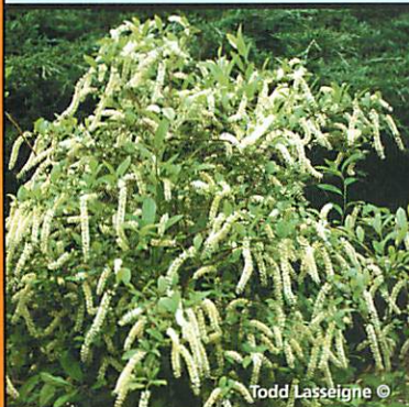
Todd Lasseigne ©