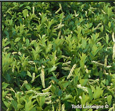
Todd Lasseigne ©