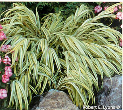
Ornamental Grasses and Companion Plants