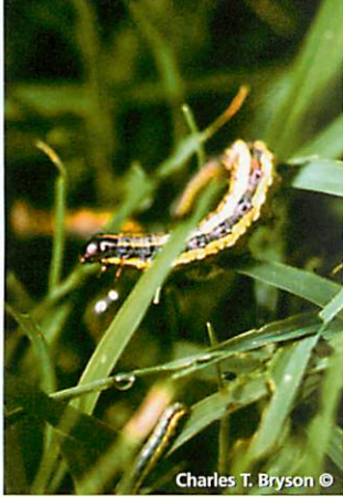
Charles T. Bryson ©