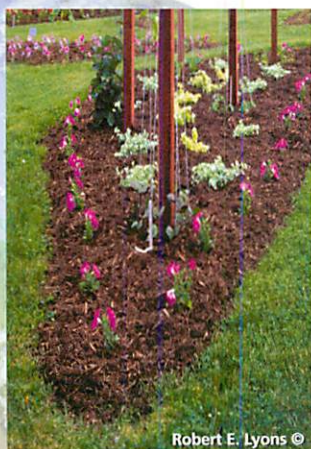
Robert E. Lyons ©

Compost is mostly used as an amendment in planting beds. It can also be used as mulch, turf or plant topdressing and as an amendment to commercial growing mixes. Home and commercial vegetable growers, nursery and greenhouse operators and landscapers use compost regularly. It is also useful in pollution prevention and remediation. Compost is used to prevent erosion of hillsides, embankments and roadsides. It also can bind heavy metals in contaminated soils and degrade many pesticides. In addition, it is used in wetland damage mitigation, stormwater filtration and biofilters. Mike Wilder