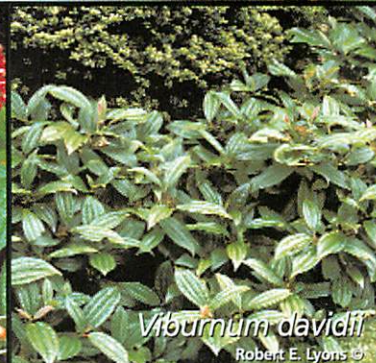
Viburnum davidii