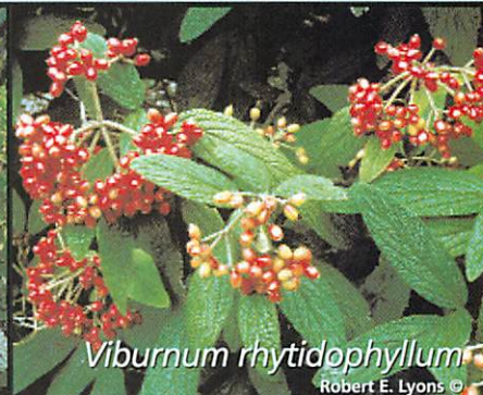
Viburnum rhytidophyllum