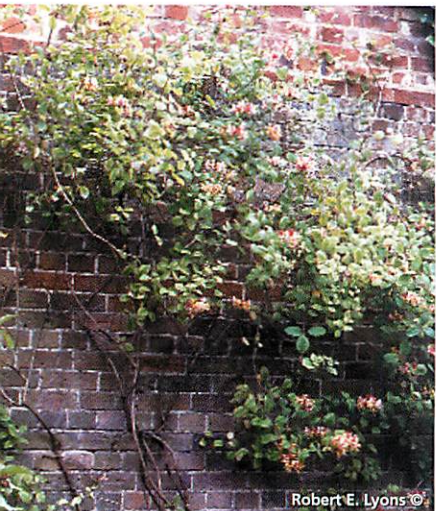
Clematis x jackmanii