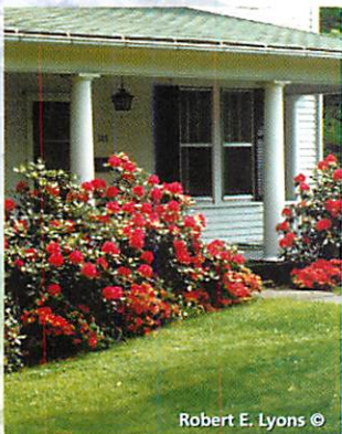
Robert E. Lyons ©

Conduct a thorough inventory and analysis of your property to identify the existing conditions. Choose plants based on how well adapted they are to those conditions. You will find that there are many wonderful plants available that will thrive under the environmental conditions on your property, have the desired plant characteristics you seek, and have few insect and disease problems. Michelle Wallace