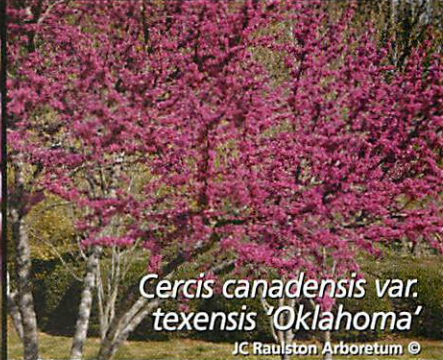
Cercis canadensis var. texensis 'Oklahoma' JC Raulston Arboretum ©