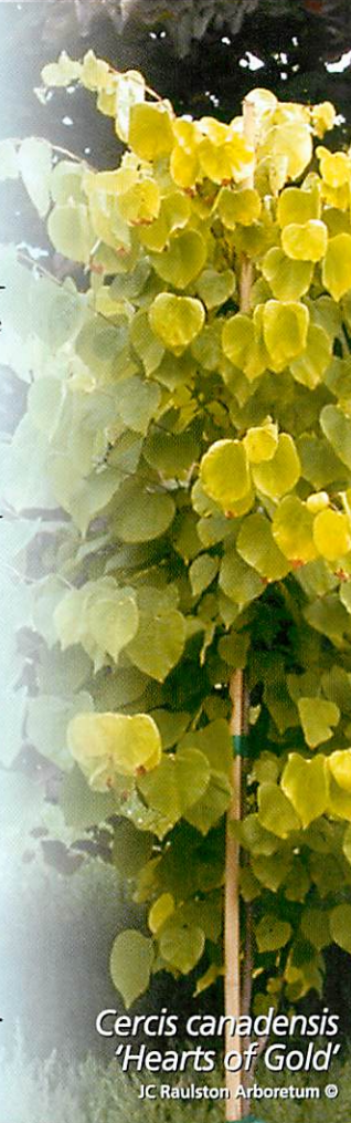
Cercis canadensis 'Hearts of Gold'