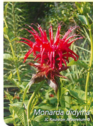
Monarda didyma