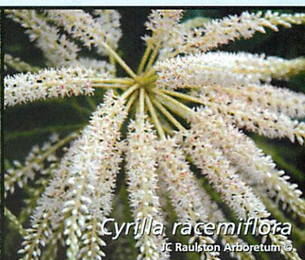
Cyrilla racemiflora