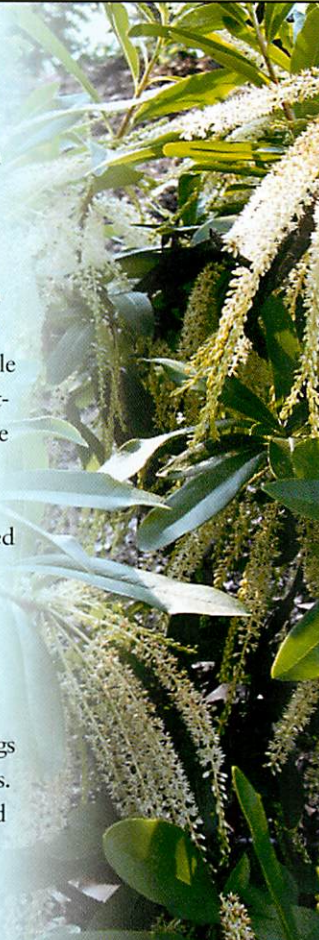
Cyrilla racemiflora