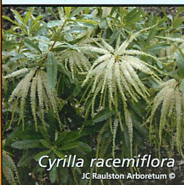
Cyrilla racemiflora