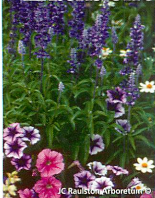
Salvia splendens and Petunia x hybrida