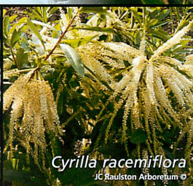
Cyrilla racemiflora JC Raulston Arboretum ©