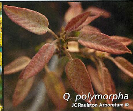
Q. polymorpha