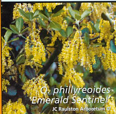
Q. phillyreoides 'Emerald Sentinel'