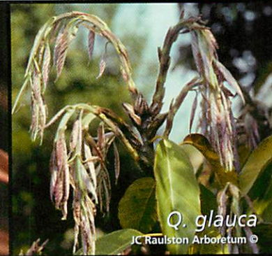
Q. glauca JC Raulston Arboretum ©