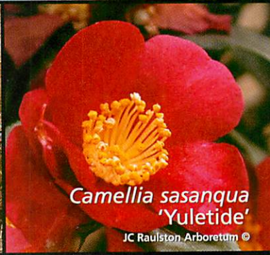
Camellia sasanqua 'Yuletide'