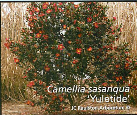
Camellia sasanqua 'Yuletide'

GossettsNursery® www.gossettsnursery.com