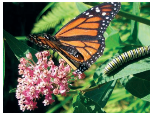
Asclepias species such as swamp milkweed are essential to monarch butterflies.