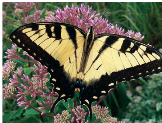
Joe-pye weed and swallowtail butterfly

So, what exactly are native plants? They are those species that evolved naturally in a region without human intervention. Red maple ( Acer rubrum ), flowering dogwood ( Cornus florida ), and butterfly weed ( Asclepias tuberosa ) are examples of the more than 3,900 species of plants native to North Carolina. These plants have