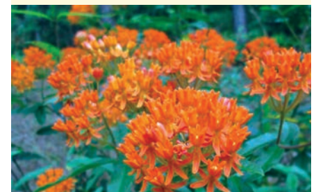
Butterfly weed ( Asclepias tuberosa)