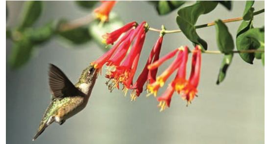
Coral honeysuckle and hummingbird