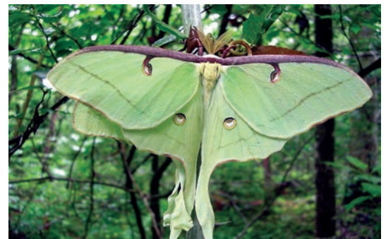
Luna moth

developed and adapted to local soil and climate conditions over thousands of years. Because they have coevolved with pollinators, insects, birds, mammals, and other wildlife, native plants are vital parts of our local ecosystems and are necessary for the survival of many species that occur in North Carolina.