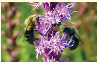
Liatris and bees

NC State University promotes equal opportunity and prohibits discrimination and harassment based upon one's age, color, disability, gender identity, genetic information, national origin, race, religion, sex (including pregnancy), sexual orientation and veteran status. NC State University, North Carolina A&T State University, U.S. Department of Agriculture and local governments cooperating.